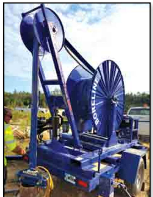
BORELINE PUMP PULLER

Apart from the extended Life Expectancy of BORELINE , pumps can be installed and retrieved without handling or contamination.