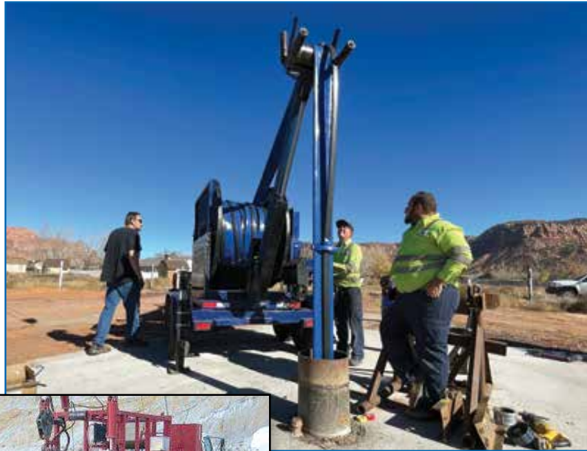
75hp x 300gpm pump installed on 580ft x 4" BORELINE FlexiRiser in 30 minutes