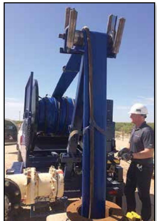
FLEXIRISER PUMP PULLER

Pumps can be installed and retrieved without handling or contamination. This is Safe and Secure.